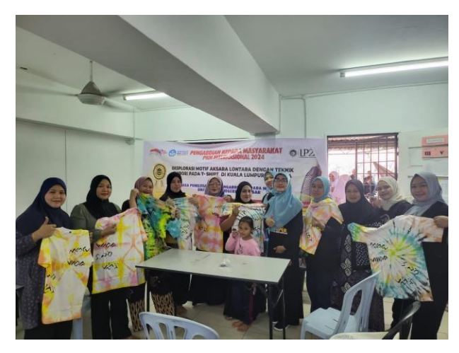
Figure 3. Enthusiastic Participants Following the Training on Making Lontara Script Motif T-Shirt Products with Shibori Technique.

This training activity using the shibori technique provides many immediate and longterm benefits for participants. In this training activity, participants listened to the material delivered orally, along with written materials distributed at the beginning of the activity. The participants were also very enthusiastic about the training, as seen from their enthusiastic attitude towards each material presented. The participants asked many questions about the content of the training, and their enthusiasm was evident. 80% of the participants asked various types of questions during the training. After completing this training activity, it is expected that the participants will be interested in applying it in their respective living environments to improve their skills and in the long run to improve the community's economy.