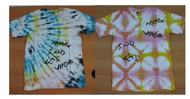
Figure 4. Lontara Script Motif T-Shirt Product with Shibori Technique.

This community service program at Guidance Studio, Kuala Lumpur, Malaysia is expected to be able to introduce Indonesian cultural wealth in the form of script motifs. The application of script in industrial innovation makes the interest of connoisseurs and the public realize the diversity of culture. The diverse culture of the archipelago's script makes it rich in aesthetic value. Aesthetic value to be explored and created into modern industrial lettering innovations (Arifin, 2019). This activity aims to bring this latest technique to the community, providing opportunities for community members to learn, create, and appreciate innovative textile craft art.