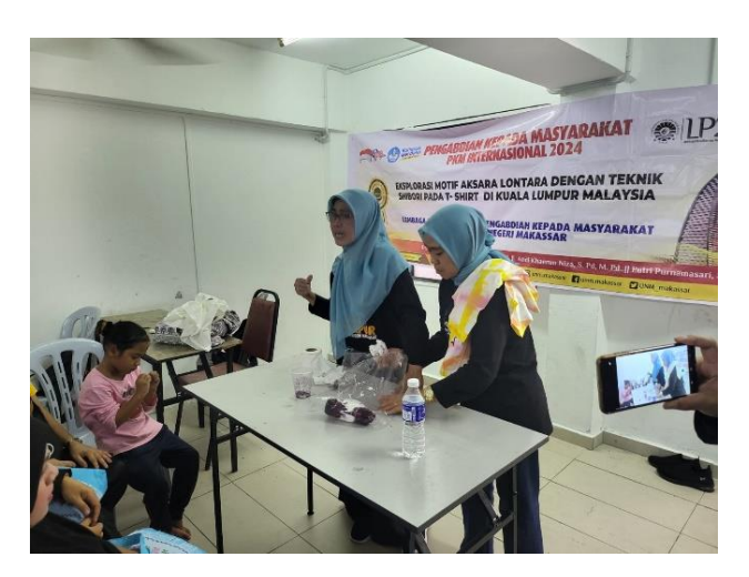
Figure 1. Demonstration of Making Lontara Script Motifs on T-Shirts with Shibori Techniq.

This training activity using the shibori technique provides many immediate and longterm benefits for participants. In this training activity, participants listened to the material delivered orally, along with written materials distributed at the beginning of the activity. The participants were also very enthusiastic about the training, as seen from their enthusiastic attitude towards each material presented. The participants asked many questions about the content of the training, and their enthusiasm was evident. 80% of the participants asked various types of questions during the training. After completing this training activity, it is expected that the participants will be interested in applying it in their respective living environments to improve their skills and in the long run to improve the community's economy.