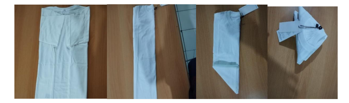
Figure 1. Folding the T-Shirt before Tying and Coloring.

Next, the instructor explained the tools and materials as well as the stages in making Lontara script motifs on T-shirts using the shibori technique. At this stage. Participants were shown and introduced to the functions of the tools and materials to be used. Then practice directly on how to make Lontara script motifs on fabric using the shibori technique. Participants were very enthusiastic about this activity as seen from the reciprocity in the form of questions and the alertness of the community during the demonstration process.